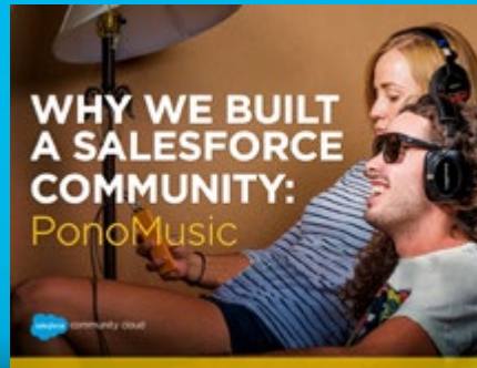
Why We Built a Salesforce Community: PonoMusic