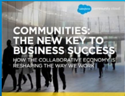
Communities: The New Key to Business Success