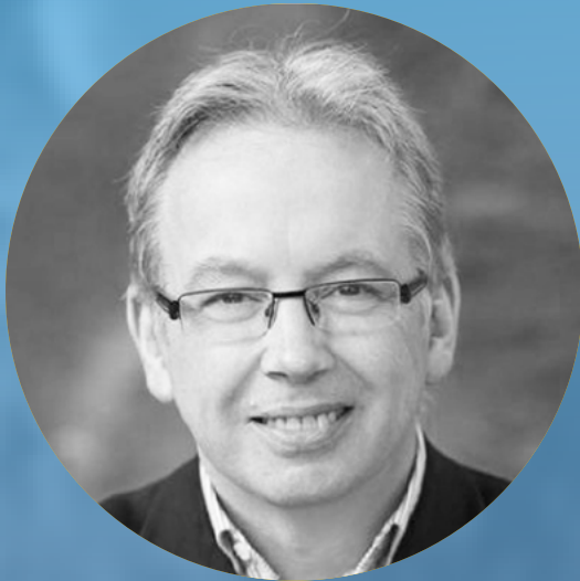
CEO, The TAS Group