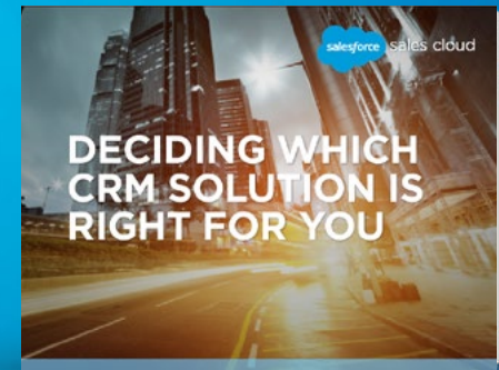
Deciding Which CRM Solution Is Right For You