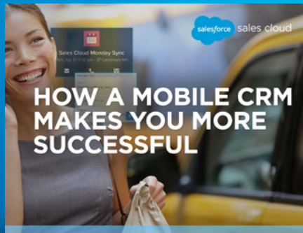
How A Mobile CRM Makes You More Successful