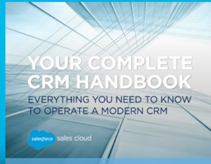
Your Complete CRM Handbook