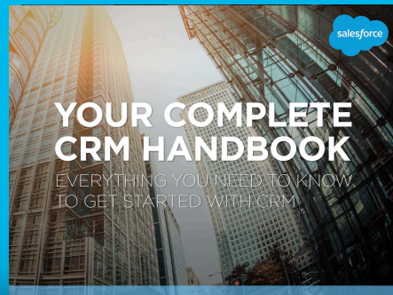
Your Complete CRM Handbook