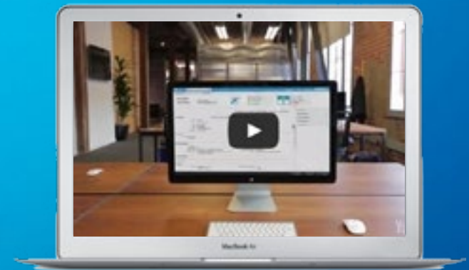
Watch a Demo