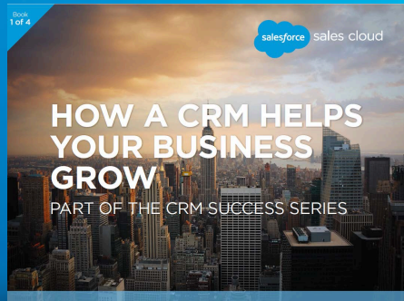
How A CRM Helps Your Business Grow