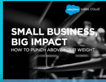
Small Business, Big Impact: How to Punch Above Your Weight