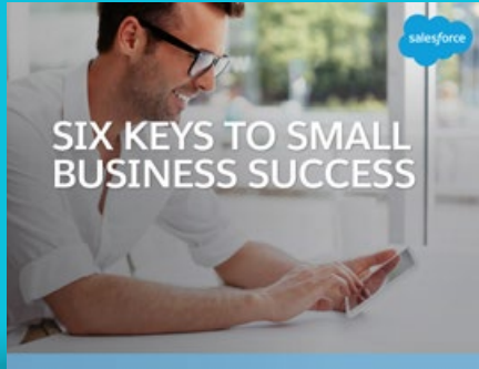
Six Keys to Small Business Success