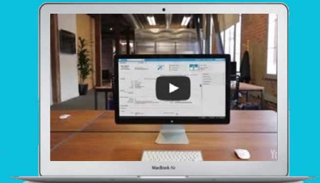
Watch a Demo